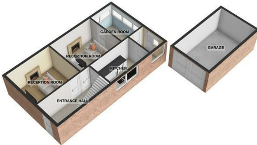
1ST FLOOR 401 sq.ft. (37.2 sq.m.) approx.